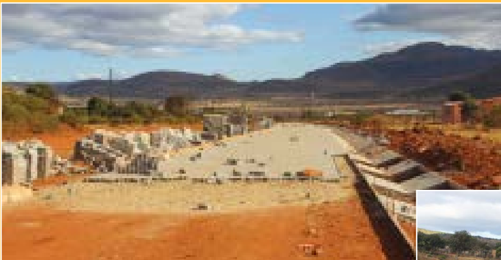
Internal access road under construction

The construction resumed again in August 2020 after lockdown restrictions were eased. The project has employed 37 people from the community of Leboeng and it is expected to be completed in August 2021.