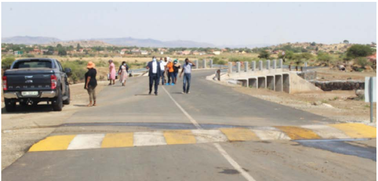
One of the three access bridges that are constructed in Apel Magotwaneng village.