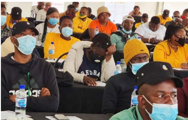
Members of the youth council